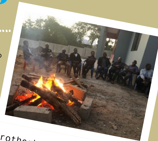
Brotherhood around the fire.