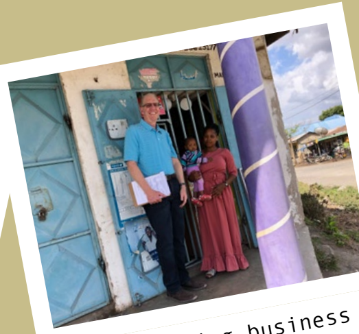
Encouraging business owners.