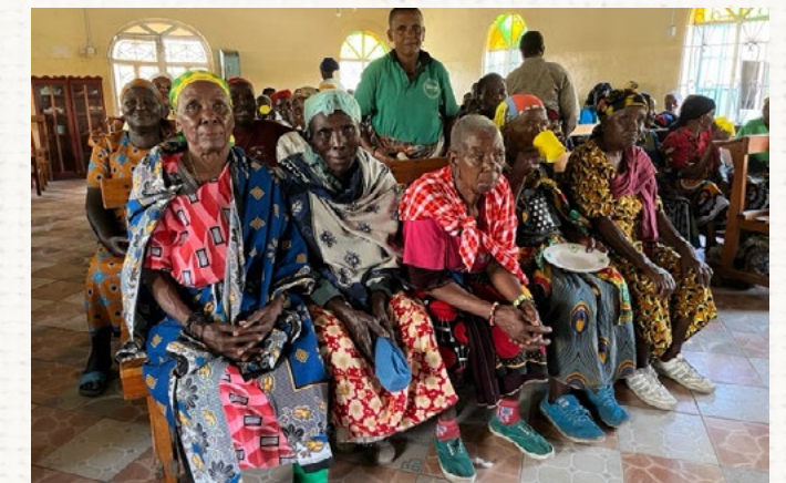
The chance to love and serve the widows.