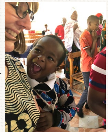
The pure joy of being together again.