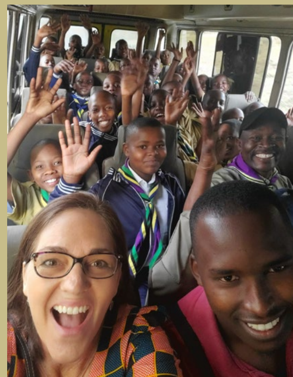
Off to see the President!