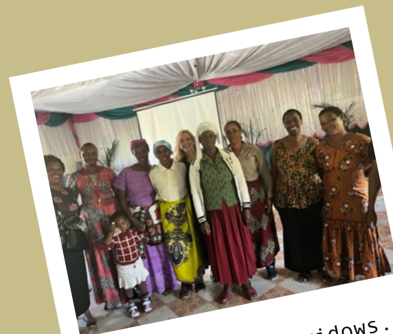
Caring for the widows.