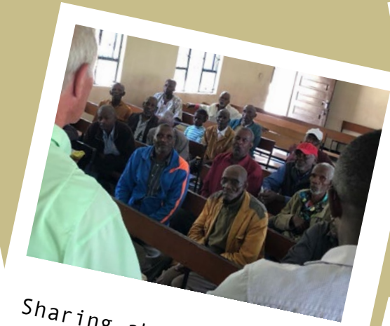
Sharing about fatherhood with the Babas group.