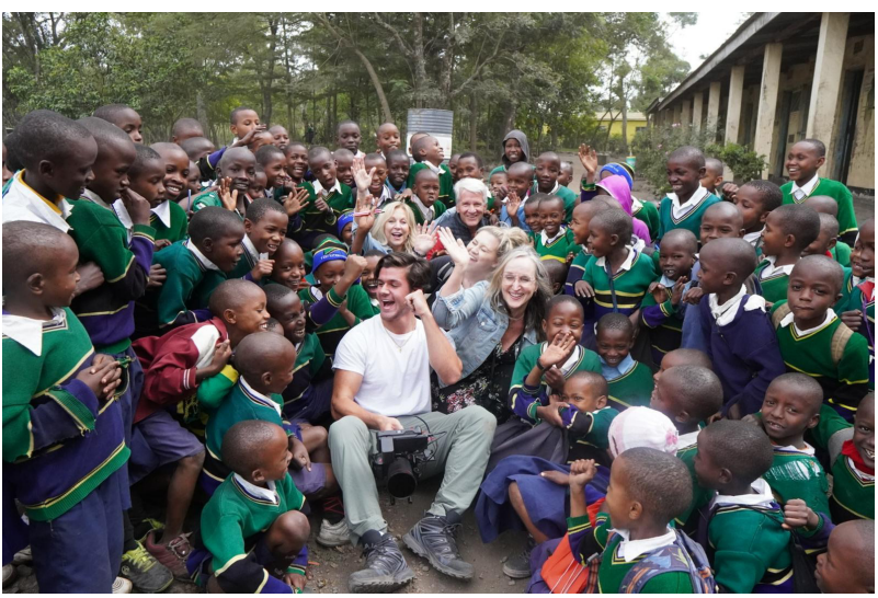
A spontaneous celebration while visiting friends at Karansi Elementary School, a government public school.