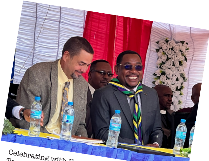
Celebrating with Hon. Omary Kipanga, Tanzania's Deputy Minister of Education.